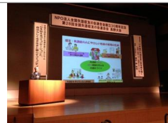
Jun. 2013 28 th Nation-wide Convention in Nagano