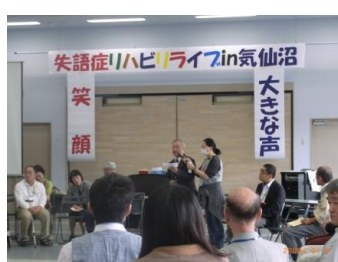
Aphasia Workshop in Kesennuma