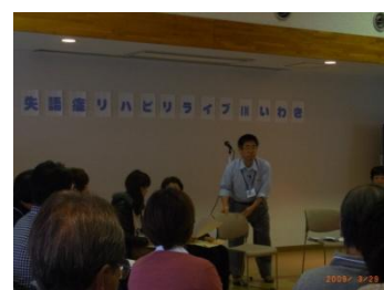
Aphasia Workshop in Iwaki