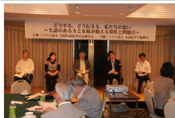
Jun. 2012 Symposium