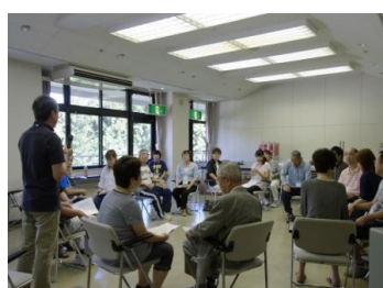
Aphasia Workshop in Ofunato