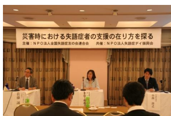
Jun. 2011 Symposium